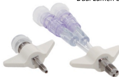
Single Lumen Bolt