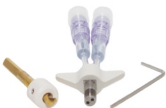
Dual Lumen Bolt Kit