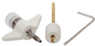
Single Lumen Bolt Kit

The bolt provides optimal fixation for the QFlow 500™ Perfusion Probe inserted 2.5-3 cm below the Dura into the white matter.